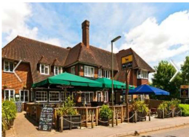
The Horseshoe Pub Lunch September 14 th