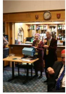
The New Year Lunch