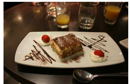
The Italian Lunch