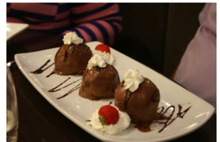
Can you guess what this is?

After a very successful lunch last year, we returned to Ponto Nuovo under the Croydon Fly-over for our first Italian lunch of 2023. 37 people sat down to choose from an extensive menu (5 main courses and 5 Dolci on offer – can you name the dessert in the picture above?), together with a glass of wine, beer or soft drink plus tea or coffee.