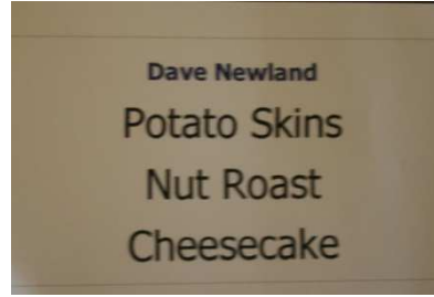
The 'Horse Shoe' Pub Lunch