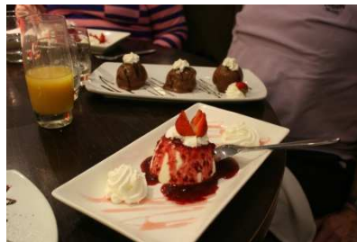
Ponte Nuovo Italian Lunch October 19 th